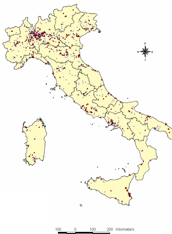
Figure 1 – Industrial establishments subject to law 334/99

The risk of industrial accidents triggered by (and combined with) floods is concentrated in plains such as the Po river plain, where major settlements are located and severe floods are possible. The Po basin –