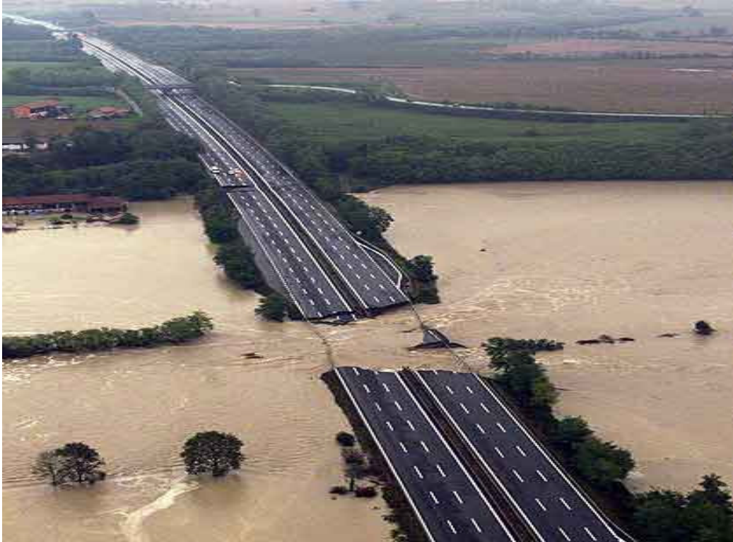
The October 2000 floods in Piemonte

Authorities were created. Their responsibility includes planning and implementation of a series of actions aimed at protecting and exploiting the soil and wisely using water resources, taking into account the physical and environmental characteristics of the land concerned.