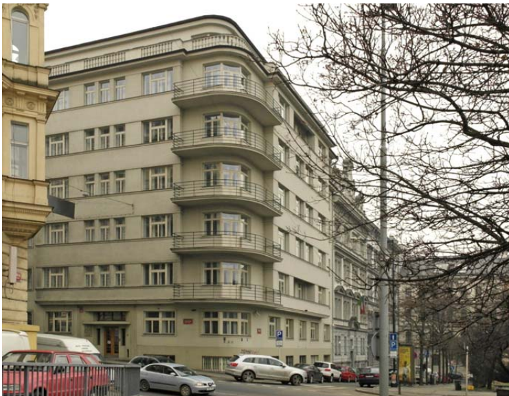
Contemporary photographs of the building

Also noteworthy is the beautiful view from the windows of some offices of the greenery in Čelakovského Park, designed by the landscape architect František Thomayer on the site of demolished city walls. Due to the construction of the metro and highway, the area of the park will be reduced and divided into two parts. It boasts about 30 species of trees, the largest being the small-leaved lime trees and Sophora japonica . In 1933 a statue was unveiled of legendary actress Otýlie Sklenářová-Malá by sculptor Ladislav Šaloun.