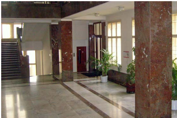
Hall in the Letenská Street wing

A staircase with railings decorated with marble leads from both sides of the entrance hall. The cladding of the building facade is made of chalky yellow sandstone from the town of Mšeno, the walls and railings are made of Bohemian marble from Loděnice and the tiles in the lobby are made of beautiful Lochkov marble. Thus the old and new parts of the building have been basically preserved to this day.