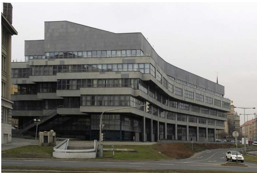
Contemporary photographs of the building

On Friday, 10 December 2010 Ministers of the European Union approved the decision of Ambassadors of the Member States of the European Union to move the administrative part of the Galileo navigation system to Prague. Twenty-two ambassadors voted for Prague at the meeting. Its biggest competitor, the Dutch project Noordwijk, only received four votes.