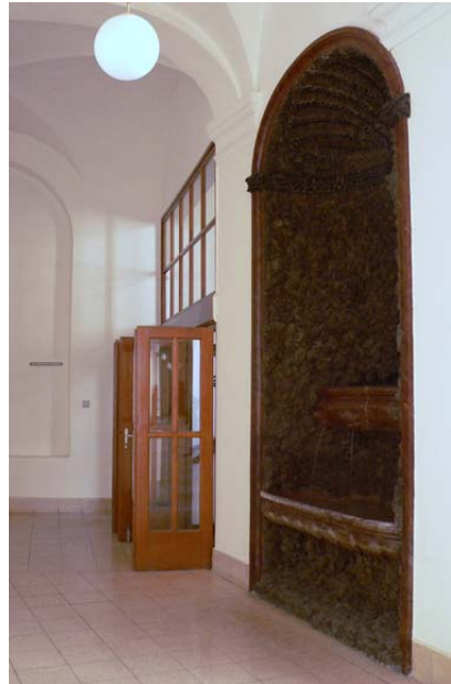
Grott's niche with fountain

On the ground floor of the cloister there is a preserved baroque dome, which in some adjacent rooms is decorated with stucco dating to the 17th and early 18th centuries. The first floor hallway is decorated with an early and high Baroque dome, while the vault on the second floor is again only early Baroque.