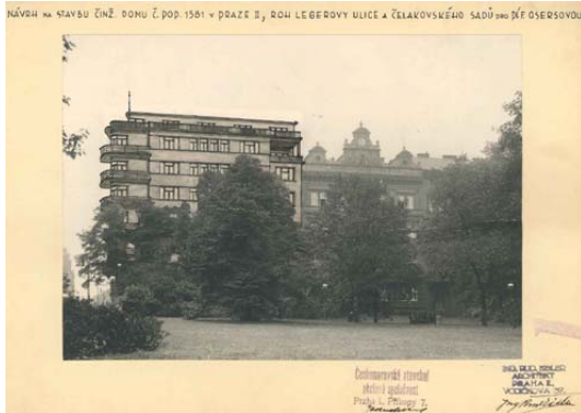
Illustration of a design in a photograph from 1936

The building had its own source of drinking water: a well with a diameter of 1.1 m.