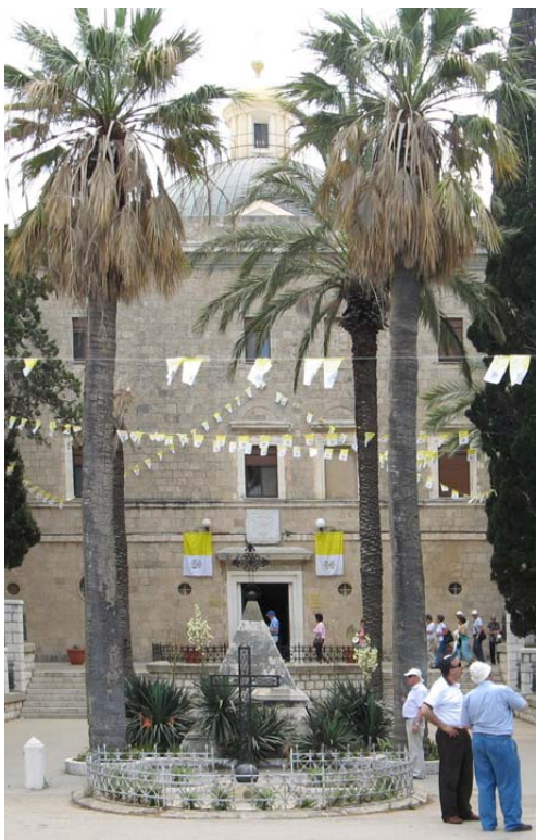
Monastery and the Basilica of Stella Maris

The first Czech Carmelite monastery was founded by Charles IV in 1347 in Prague. It includes the Church of Our Lady of the Snows, which is the tallest church building in the city. In 1351, Charles IV built another Carmelite monastery in Tachov.