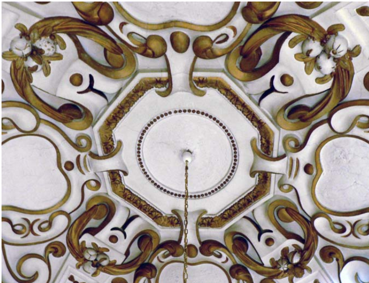
The stucco decoration of the vaulted rooms of the east wing

In the east wing there is a very interesting vaulted room. The central dome is decorated with stucco mirrors with motifs of hanging scarves and fruit and acanthus blossoms 10 , which are characteristic of the decorative arts of the 17th century.