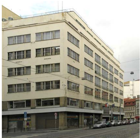
Contemporary photographs of the building

The original building was owned by a mining and metallurgical company founded in 1905 as the Austrian Mining and Smelting Company based in Vienna. After the fall of Austria-Hungary it moved to Brno, which was conveniently close to the North Moravian industrial areas. Because of its connection to the Czechoslovak arms industry, its significance for the newly formed state was not only economic but also strategic.