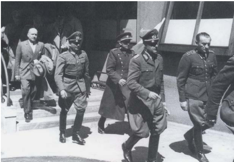
The German delegation after the signing of the surrender (Gen. Toussaint centre)