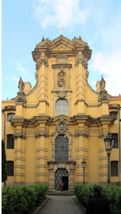
Facade of the Church of St. Joseph