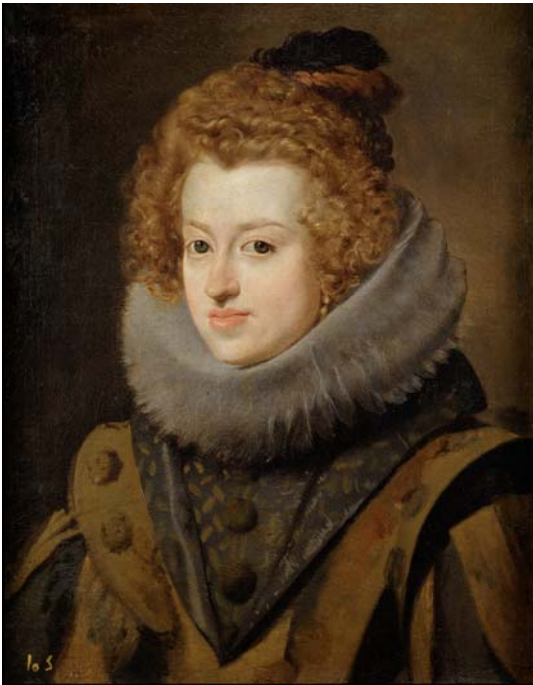
Maria Anna of Spain in a painting by Diego Velasquez

The idea of establishing a monastery was revived by Maria Anna of Spain, wife of Ferdinand III. According to some sources, she could not get pregnant for a long time, and therefore promised that if she could give birth to a child, she would establish a Carmelite monastery in Prague. God heard her plea and on 8 September 1633 she gave birth to a son (the future Ferdinand IV). Her husband also supported the idea, but once again the monastery was not built. Pope Innocent X insisted that the newly formed women's monasteries be placed under the authority of the bishops and the Discalced Carmelites did not want to admit the weakened position of their superiors.