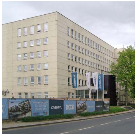
Contemporary photographs of the building

The founder of the construction was České loděnice, a. s., which has been active on the market since the 19th century. It is known as a traditional manufacturer of cargo ships, engineering vessels and floating equipment. The company acquired the building decision on 9 March 1987 and the building permit more than a year later, on 10 June 1988. The architect of the project is design company IDOP, Olomouc. Originally the building was used as a dormitory with a canteen. In 1989 it was doubtful whether the building would ever be finished, but it was finally completed on 30 June 1992.