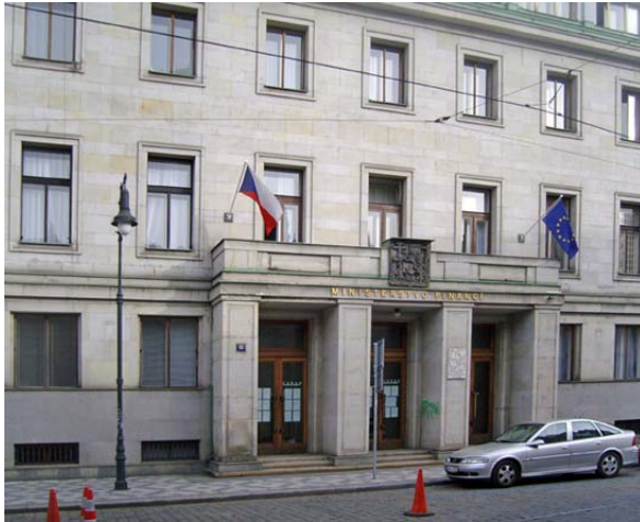
Main entrance to the building from Letenská Street

Based on a design by architect František Roith, in 1928 the construction of two extension wings toward Dražického Square and Letenská Street was started. The main entrance with a grand entrance hall is located in the wing in Letenská Street.