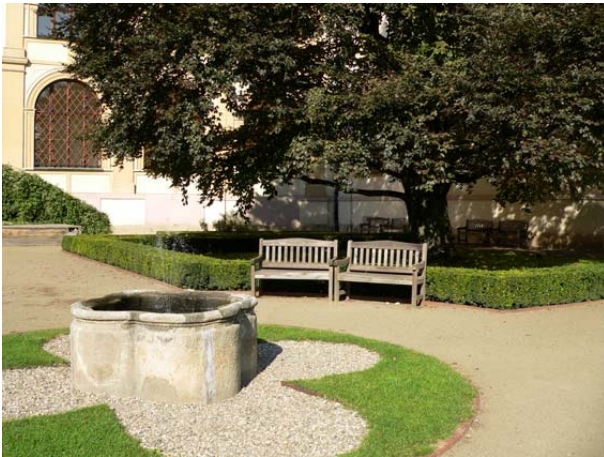
Baroque fountain in the shape of a four-leaf clover in the back of the garden

On the terrace there is a newly restored Baroque fountain in the shape of a four-leaf clover. It was discovered accidentally during garden work in 1980. First it was supposed to be only planted with flowers, but after cleaning it turned out that it was much more beautiful than originally anticipated. Finally, it was decided that the fountain would be equipped and fitted into a seedbed. Around it were stationed benches, whose design recalls the atmosphere of English gardens.