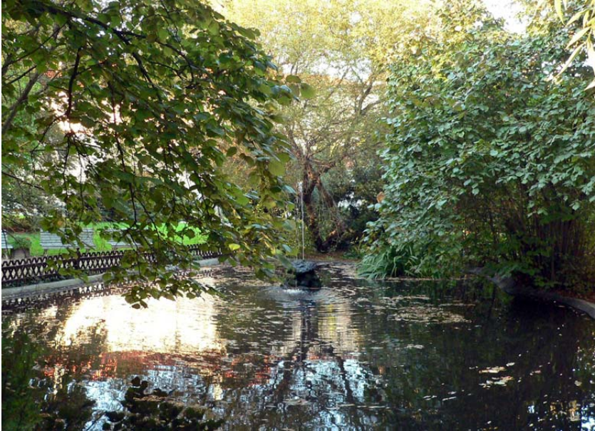
The pond in the front part of the garden

In August 2002, the garden was destroyed by a flood, the water reaching up to nearly four metres. The repairs cost the City District of Prague 1 CZK 1.5 million and took less than half a year. After the reconstruction some parts of it are even more beautiful than before.