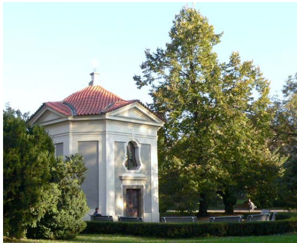
The Chapel of St. Teresa of Avila

Three chapels are still preserved here to this day: the oldest is the stalactite chapel of St. Elijah built between 1660 and 1670, whose ground plan recalls the Latin cross. The chapel is in very poor condition