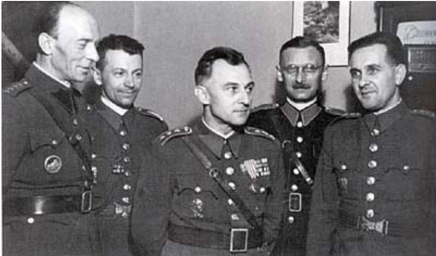
Military Command of the Great Prague "Bartoš" (Colonel Bürger in the middle)

The headquarters had at its disposal six Luftschutz battalions (anti-aircraft protection police), 4,026 uniformed police officers, 425 employees of electric companies, 400 policemen, 385 members of government troops and 200 members of the former financial patrol. During the uprising, the headquarters was in charge of all the smaller components that were created during the fighting.