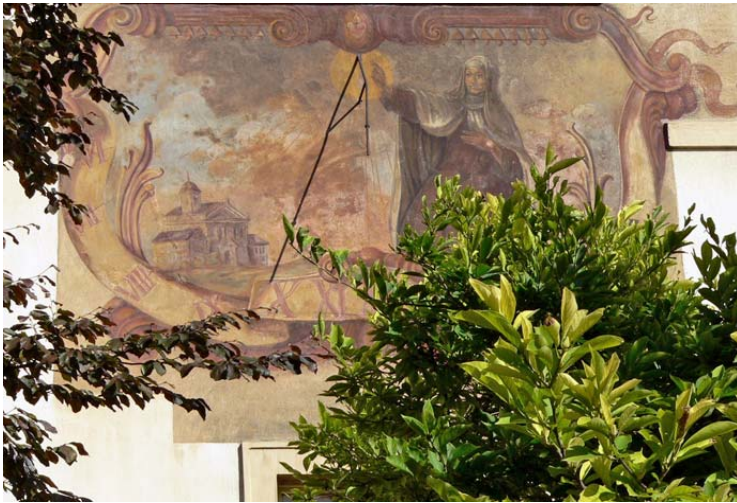
The sundial with the blessing of Marie Elekta

and no longer has its original interior (only five not very well done scenes from the life of St. Elijah by an unknown author are on the vault). The valuable statue of St. Joseph by Matěj Václav Jäckel is now stored in the depository of the National Gallery. The chapel is currently under reconstruction. According to the monastery's chronicles, in 1743 at the expense of Eleonore von Wallenstein the baroque chapel of Teresa of Avila was built. Other sources cite 1715 as the year of construction. The furnishings of the chapel have not been preserved. The repainted frescoes on the walls date to 1745, allegedly by Jan Karel Kovář. From the front they create the illusion of an altar, and from the side they depict scenes from the life of St. Teresa. The fresco in the dome is also a celebration of the saint. The Chapel of St. John of Nepomuk was built around the second half of the 17th century during the construction of the boundary wall arcade. It consists of two niches. The deeper one used to contain the statue of St. John of Nepomuk and the shallower one the door to the spiral staircase that leads to the terrace above the chapel. The chapel is now under reconstruction.