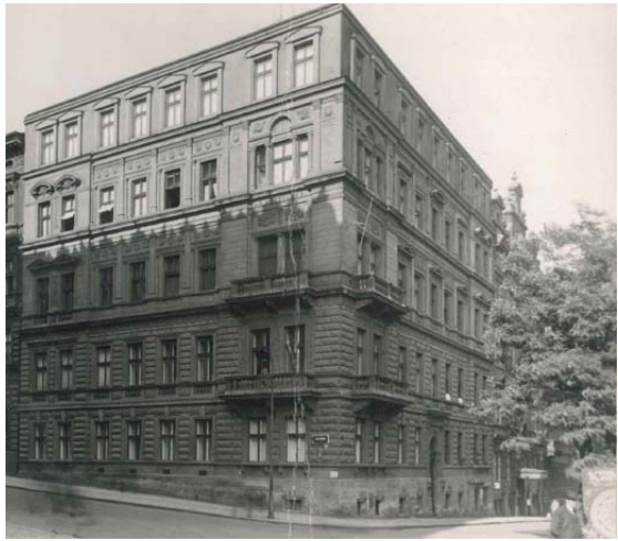
The original house in a photo dating to the 1930s