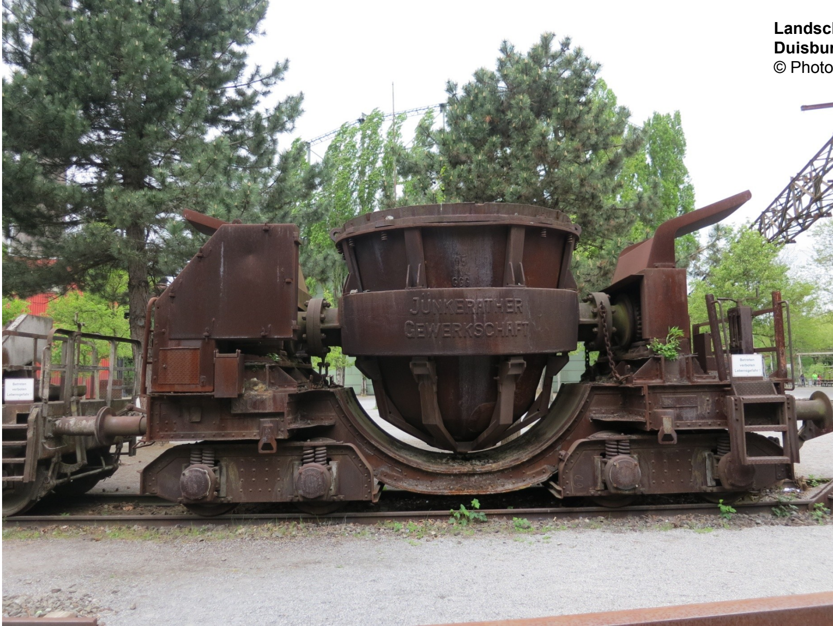
The 2013 scientific meeting included a tour in Landschaftspark Duisburg-Nord. See the early rail transport of melting ore.